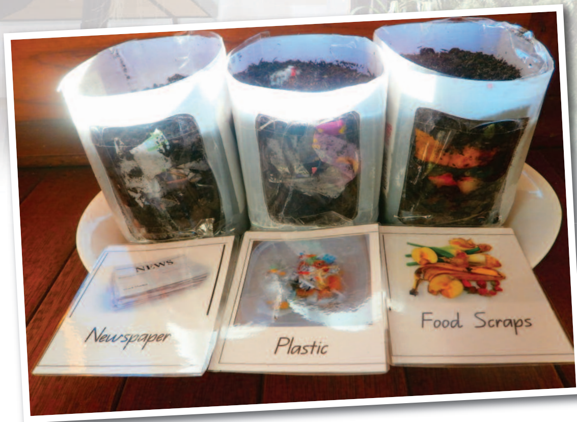
Organic vs non-organic breakdown experiment