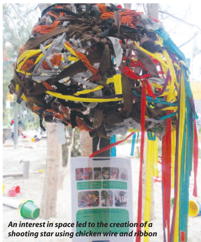
An interest in space led to the creation of a shooting star using chicken wire and ribbon

In addition, Ilka came out to our service for a weaving session and demonstrated to the children how to use a loom correctly and how to weave using arms as the warp and the weft in a giant webbing piece - thus 'intertwining' other learning outcomes, such as spatial awareness and gross motor abilities, into this context. Following on from this experience we then had two excursions within our local community to the Hand Weavers and Spinners Guild in Carlton North. The Guild members were more than happy to have "the next generation of weavers" visit and we