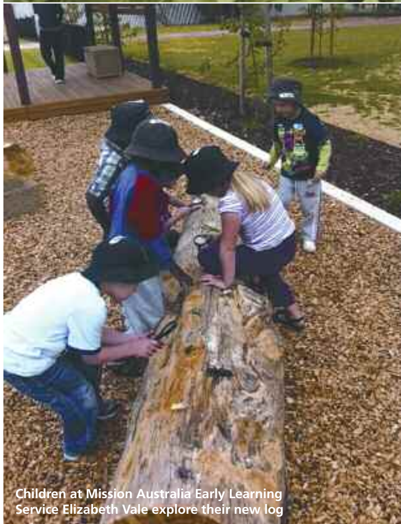
Children at Mission Australia Early Learning Service Elizabeth Vale explore their new log