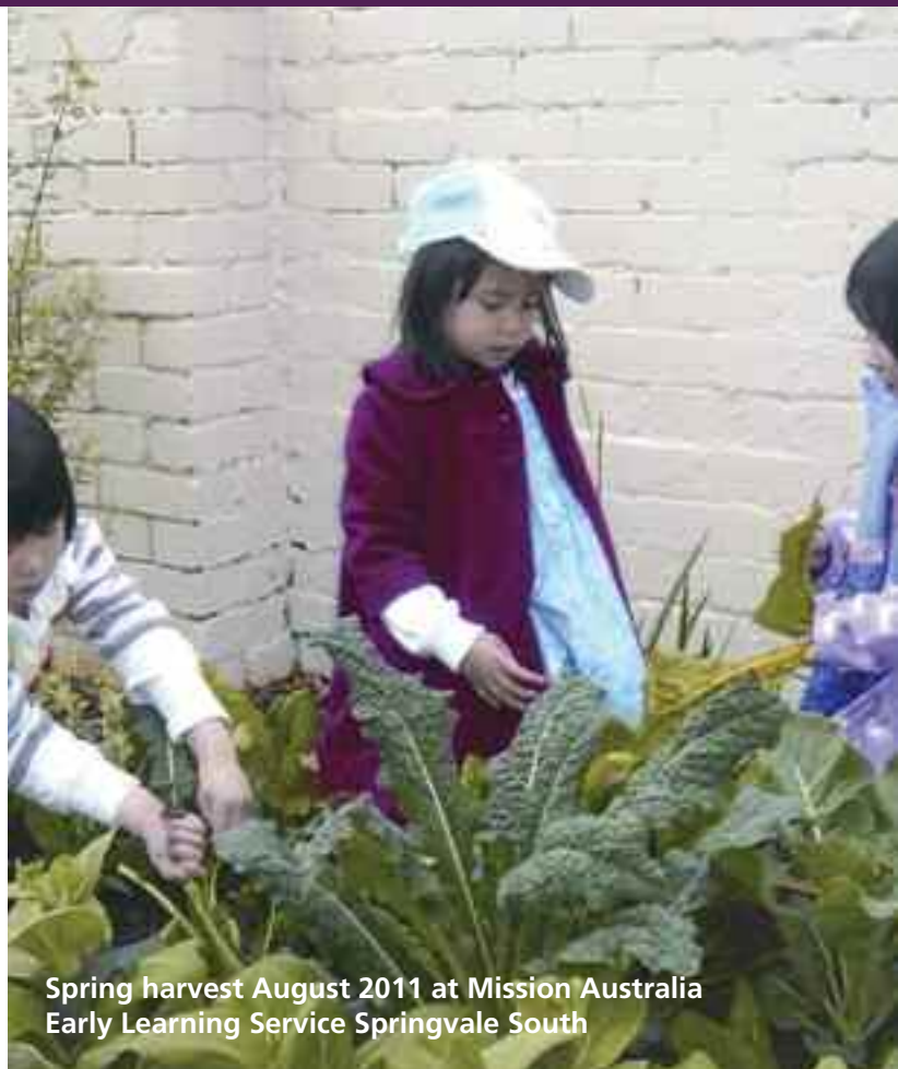
Spring harvest August 2011 at Mission Australia Early Learning Service Springvale South

All of this has been achieved with the fantastic support of the Board of Mission Australia and the whole of the MA team. To have the weight of such an iconic organisation and the financial backing of the Board inspires the early learning team every day. We are well on the way to financial sustainability and the provision of high quality education and care for all of the children in Mission Australia Early Learning Services.